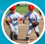
SHEELS SPORTS COMPLEX