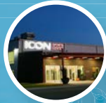
ICON SPORTS CENTER